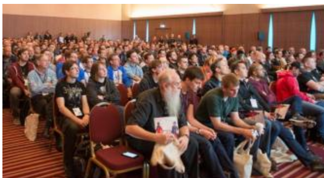
Figure 1- BSides London