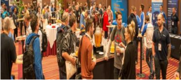
Figure 2- B-Sides London Networking