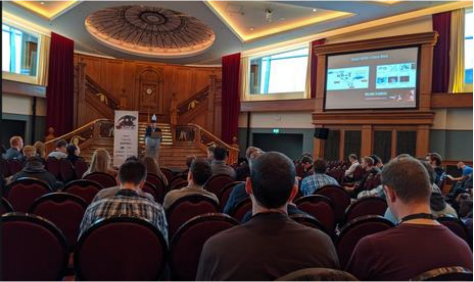
Figure 6- BSide Belfast