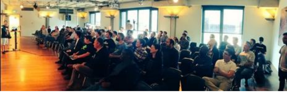
Figure 5- BSide Amsterdam