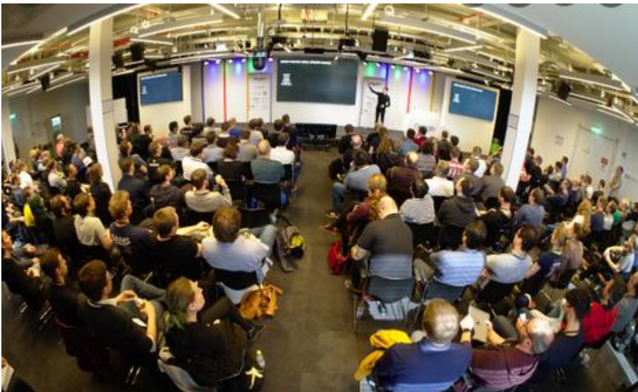
Figure 4- B-Sides Munich