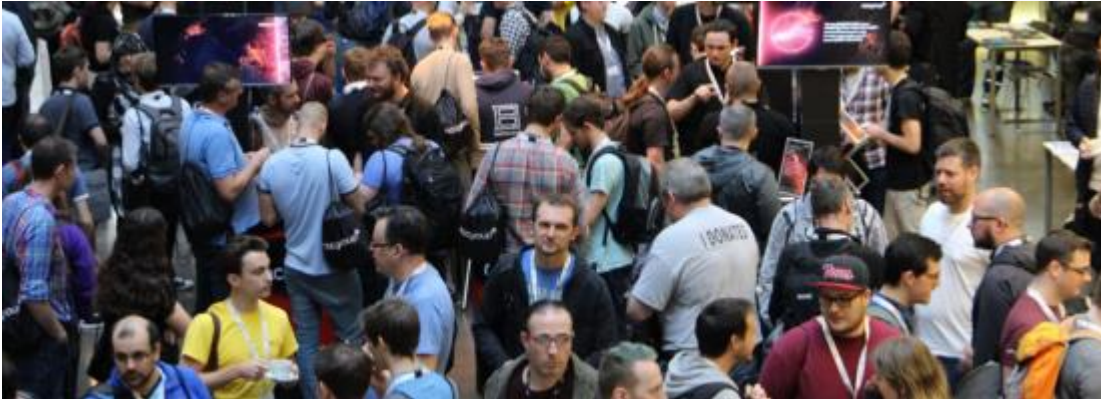
Figure 3- B-Sides Manchester